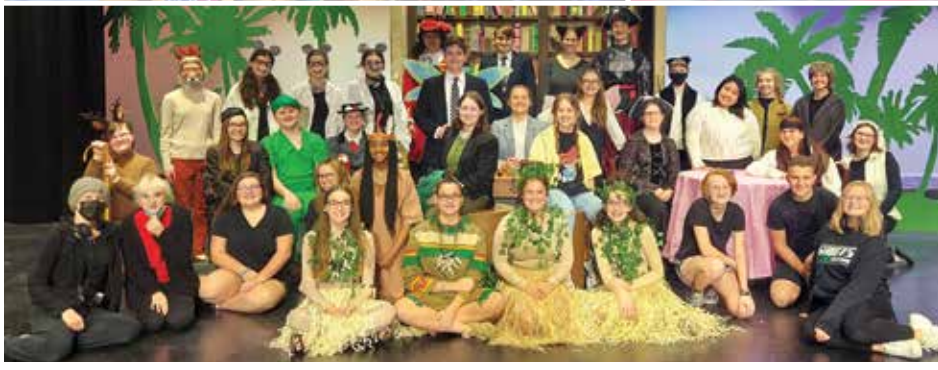
The Seton-Elder Drama club received rave reviews for their fall play, CSI:Neverland. Congratulations to the cast and crew!